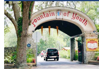
Famous "Fountain of Youth"