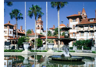
St. Augustine, our Nation's Oldest City

Day 9: After enjoying a Continental Breakfast, you will depart for home... a perfect time to chat with your friends about all the fun things you've done, the great sights you've seen and where your next group trip will take you!