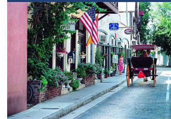
Historic St. George St